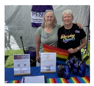
Community Events: Boulder Pride - June 30th

Sunshine, music, and a great turnout were all in order to make for an incredible event. PEN's Board and Staff enjoyed being there and the opportunity to meet with those who stopped by our table.